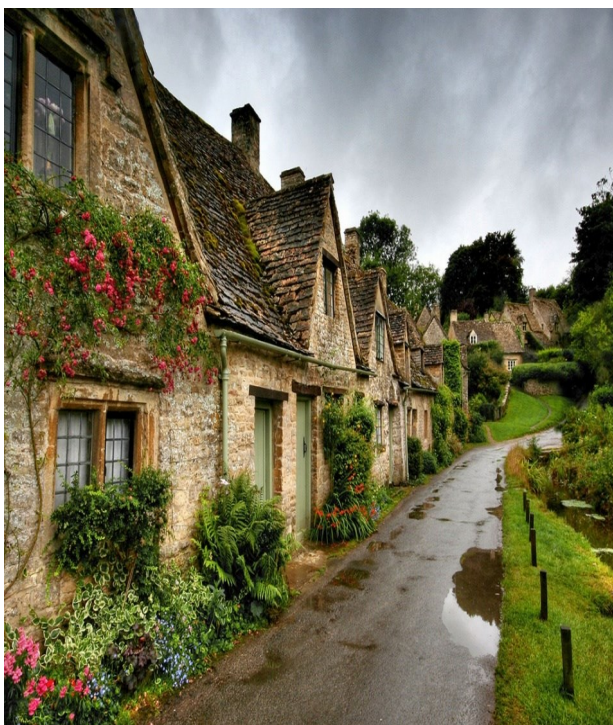
"The Irish live in one another's shelters"

www.irishheritagesociety.net irishheritagesociety@outlook.com